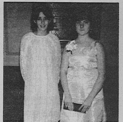
Fidelity Triangle new Members.